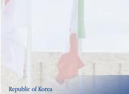
Republic of Korea