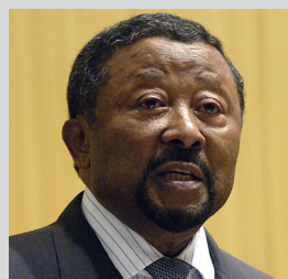
Jean Ping, Chairman, African Union Commission

challenges and to prepare Africa for a brighter future; as another African proverb says, “for tomorrow belongs to the people who prepare for it today”.