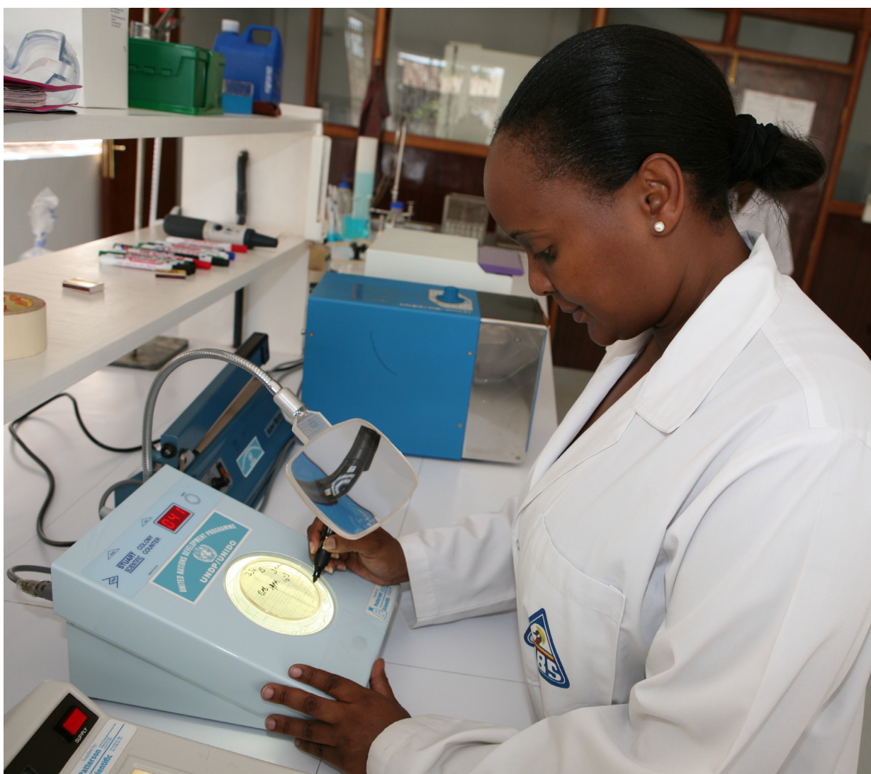
A scientist working at the National Bureau for Standards in Uganda

The action plan identifies a number of critical priorities that need to be addressed at national, regional, continental, and international levels to promote the coherent industrial development of Africa.