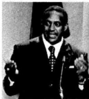
Kandeh Yumkella, Director-General, UNIDO

Kandeh Yumkella, Director-General, UN Industrial Development Organization (UNIDO), underscored the essential involvement of industry in addressing the world's environmental challenges. He said the conference aims to: provide business the opportunity to demonstrate and identify technologies; find ways to sustain manufacturing growth in Asia; raise the awareness of greening in Asia; and move discussions on green industry from the technical and possible to real policy measures. He stressed that a new shift to clean manufacturing was needed to facilitate further development in the region.