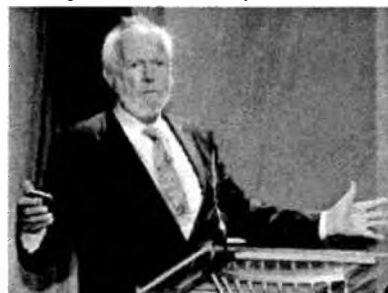
Ernst Ulrich von Weizsacker, Co-chair, International Panel for Sustainable Resource Management

Ernst Ulrich von Weizsacker, Co-chair, International Panel for Sustainable Resource Management, said many businesses are moving towards green investments, and that the next growth wave will be stimulated by green industries. He stressed a paradigm shift for industrialization through the reduction of carbon and energy intensities. He highlighted several policy options, including: increased