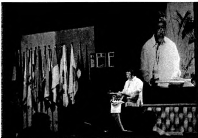
Enrique Manalo, the Philippines

MINISTERIAL STATEMENTS: Bangladesh highlighted increased global levels of environmental awareness, and noted the importance of the Declaration as a roadmap for guiding increased economic growth in Asia. He said that existing environmental protocols had not been fully successful, and listed a number of Bangladesh's own national environmental policies. He urged UNIDO, ESCAP, and the UN Environment Programme (UNEP) to continue supporting green economic growth in Asia. China stressed that the government has made