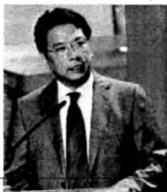
Peter Favila, Secretary, Department of Trade and Industry, the Philippines

Welcoming delegates, Peter Favila, Secretary, Department of Trade and Industry, the Philippines, said the Conference provides an opportunity to address approaches for improving industries' environmental performance. He noted that the Conference aims to highlight new supply chains for industry, raise awareness on the knowledge and capacity of institutions, and assist institutions and bodies to lead the way in implementing low carbon paths for industrial development.