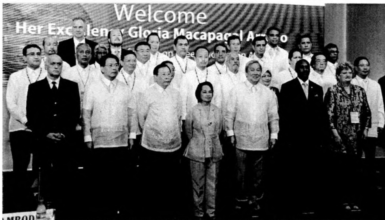
Delegates from the High-Level plenary with H.E. President Gloria Macapagal-Arroyo