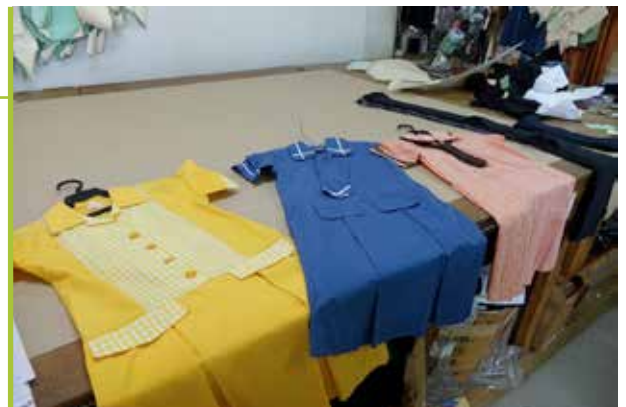
UNIDO's Expert Mission to Barbados in August 2014 highlighted the potential of local designs for improving the sustainable development of the apparel industry sector.

Barbados: 14-15 August 2014. Through a SELA-SMEs Programme supported by UNIDO and in collaboration with the Barbados Investment and Development Corporation (BIDC), a seminar was organized on the “Apparel Industry and Economic Development in the Caribbean: Efficient Planning and Allocation of Resources” in Bridgetown, Barbados. Its main objective was to assess the challenges and opportunities to improve sustainable development in this sector and associated sub-sectors under Caribbean conditions that could benefit all stakeholders, including local communities. In particular, two UNIDO-Barbados counterparts staged video conferences involving the participation of a UNIDO apparel industry expert, thus setting the tone for a UNIDO intervention in this sector in Barbados.