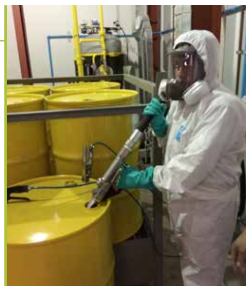
Handling a new chemical agent for foam elaboration in a refrigerator's factory based on a technology change implemented through a UNIDO project for CFC substitution in Guatemala.