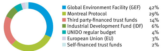
UNIDO’s project funding sources 2013-2014

Source: UNIDO Annual Reports 2013 - 2014