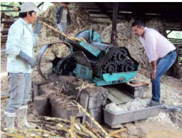
Colombian expert assessing Ecuadorian small processors of sugar cane through cooperation supported by UNIDO IKB project in August 2013.