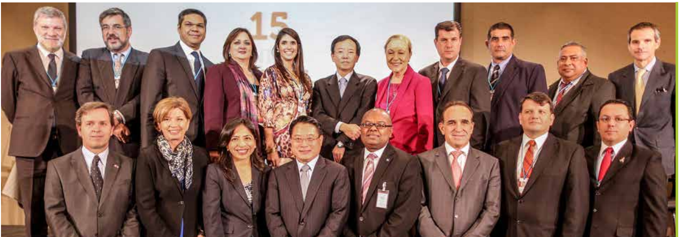
Regional Conference of LAC Industry Ministers organized in the framework of the UNIDO XV General Conference in Lima, Peru in December 2013.

UNIDO works closely with the Community of Latin American and Caribbean States (CELAC), the largest regional bloc representing 33 sovereign countries in the Americas, all of which are also UNIDO Member States.