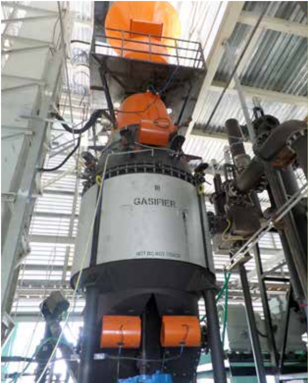
Cuban biomass gasification power plant installed with Indian technology as part of South-South cooperation with GEF co-financing.

November 2013. The DG visited Mexico City, Mexico where he met inter alia with governmental ministries and private sector partners to enhance cooperation on Mexico's energy and environmental sectors. UNIDO's support of Mexico's fulfilment of its Montreal Protocol commitments was gratefully acknowledged. It was agreed to further expand UNIDO's role in support of Mexico's implementation of the Stockholm Convention on Persistent Organic Pollutants (POPs). UNIDO will be a strategic partner for Mexico, updating its National Implementation Plan (NIP) and implementing Best Available Technologies (BAT) and Best Practices (BP) projects. The Mexican Government's target regarding green industries should be increased to at least 1.8% of GDP by 2020. UNIDO can play a vital role in this endeavor.