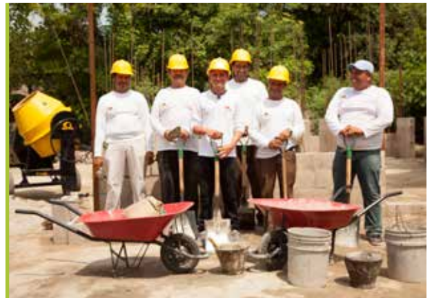
UNIDO-UNDP-UN Habitat Joint Programme funded by Spanish SDG-Fund in El Salvador. UNIDO interventions targeted the development of the domestic housing construction value chain.

After concluding the UNDAF process, some LAC governments requested the UN System to participate in a results-based bi-annual planning process to identify projects in which UN agencies could participate jointly. UNIDO has identified possible cooperation with UNDP, FAO and UNESCO in some ongoing projects, in particular for agro-industrial and artisanal sectors. For example, in Ecuador, based on the UNDAF programmatic planning matrix, a number of joint project ideas have been developed together with FAO, UNDP and IFAD. Two were submitted to the Spanish Sustainable Development Goal Fund and one—"Improving Food Safety and Nutrition Levels among Children by Increasing the Quality of Local Food Production"—was approved and commenced operations in February 2015. There are similar projects for Cuba, Colombia and El Salvador.