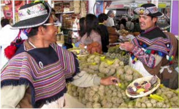
Local producers of native potatoes “Sumaq Sonqo” in Mistura, Peru, participating in a UNIDO project finalized in 2013 for the promotion of origin consortia and collective brands for typical food products as tools for sustainable rural development.