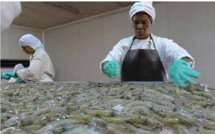
A LAC regional initiative to enhance the competitiveness of the shrimp value chain based on South-South cooperation and compliance with international quality and environmental standards

The second initiative aims to improve the productivity and competitiveness of the shrimp value chain in six LAC countries—Colombia, Cuba, the Dominican Republic, Ecuador, Nicaragua and Mexico—through strengthened regional cooperation. It will encourage synergies and partnerships between academia, public institutions and private industrial sectors and will also improve links between local businesses and national, regional and global markets. The overall goal is to increase the financial revenues of actors within the value chains by: 1) enhancing organizational and economic management along the entire value chain, based on regional complementarities; 2) increasing the productivity and efficiency of shrimp production and processing; 3) strengthening technological and human capacities to ensure conformity with export market requirements; and 4) enabling environmental sustainability of the entire value chain.