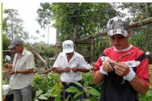
Local producers are trained on cultivation techniques (grafting) to improve productivity As part of UNIDO's intervention for cocoa value chain development in Nicaragua.