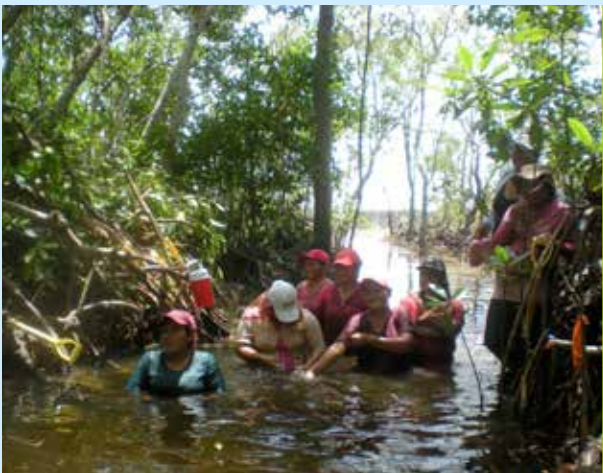
Restoration of 1,300 hectares of mangrove coastal wetlands within the Integrated Assessment and Management of the Gulf of Mexico Large Marine Ecosystem project.

A UNIDO-driven bilateral initiative between the United States and Mexico, this project began in 2009 and represents a major sub-regional “triangular cooperation” achievement. Notably, this is the only GEF-funded project in which the United States fully participates. A second phase for the period 2015-2017 is under negotiation. UNIDO prepared a Project Identification Form (PIF) and Strategic Action Plan (SAP) to be reviewed by GEF and will be submitted as an early GEF-6 flagship project.