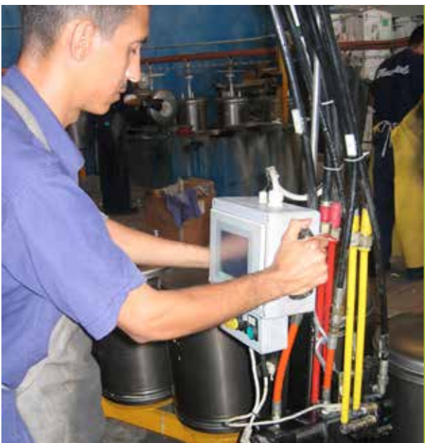
Substitution of foaming agent in the water-heater equipment production as part of CFC phase-out project in Venezuela.