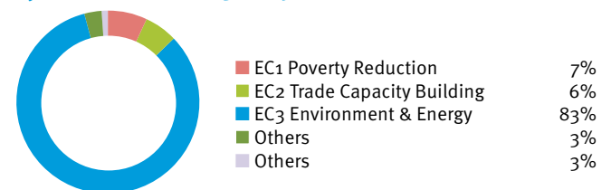
UNIDO technical cooperation implementation percentages by thematic area; 2013-2014.

Source: UNIDO Annual Reports 2013 and 2014