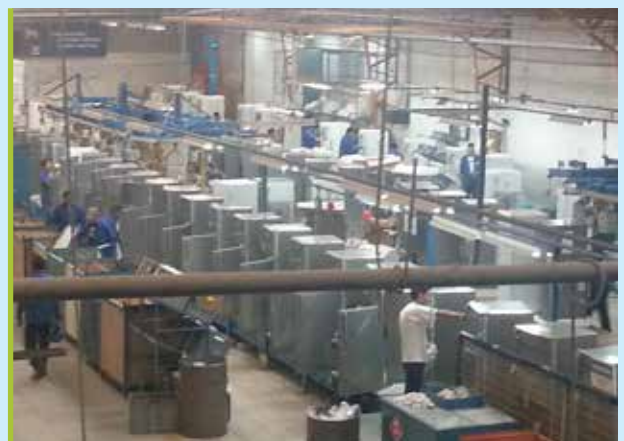
HCFC phase-out project development at a large domestic refrigerators manufacturing enterprise in Ecuador