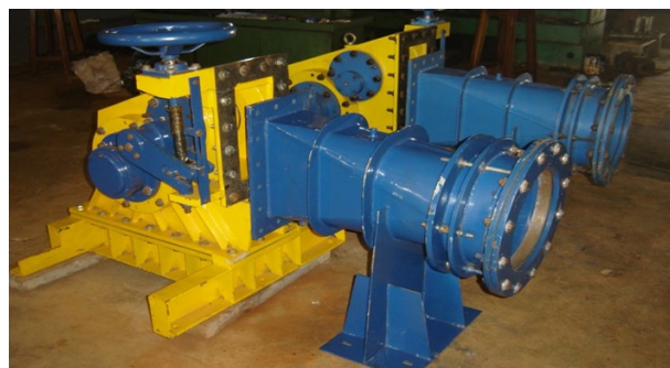
Two number 35kW SHP Turbine manufactured by Nigerians through a technology transfer partnership between UNIDO/NASENI

UNIDO small hydro projects are ongoing in Osun and Ogun states while others are in planning stage in the North-Eastern states.