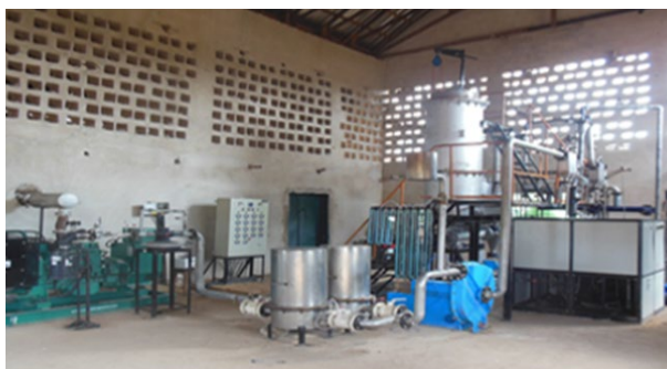
Demonstration of MINI-GRID BIOMASS PROJECT, Ebonyi state

In supporting the rural electrification program of the Federal Government of Nigeria, UNIDO is implementing renewable energy projects. The UNIDO renewable energy projects focus on using biomass and small hydro power to generate electricity.