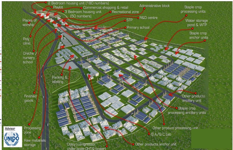
Staple Crop Processing Zones - Master Plan