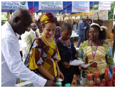
Agropreneurs at the just concluded Work Fair at Songhai Center (Porto Novo, Benin Republic) organized by UNIDO, Songhai Farms and other development partner 8 October 2011