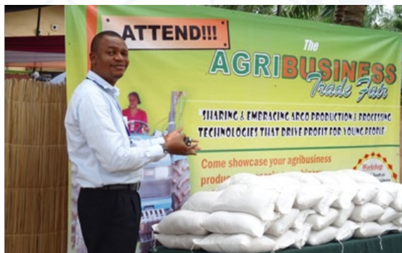
The Ebonyi State Government in Nigeria trained unemployed youth in agriculture at the Songhai farm in Benin and partner with UNIDO to boost the entrepreneurship and ICT skills of the graduates. After their training, the government granted each graduate a microcredit to start individual agricultural enterprise September 2010

A Policy guideline for engaging youths in agribusiness is being developed and will be used for program development and advocacy