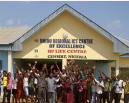
The Ebonyi State Government in Nigeria trained unemployed youth in agriculture at the Songhai farm in Benin and partner with UNIDO to boost the entrepreneurship and ICT skills of the graduates. After their training, the government granted each graduate a microcredit to start individual agricultural enterprise September 2010