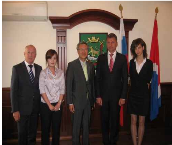
Meeting with the Government of Vladivostok City