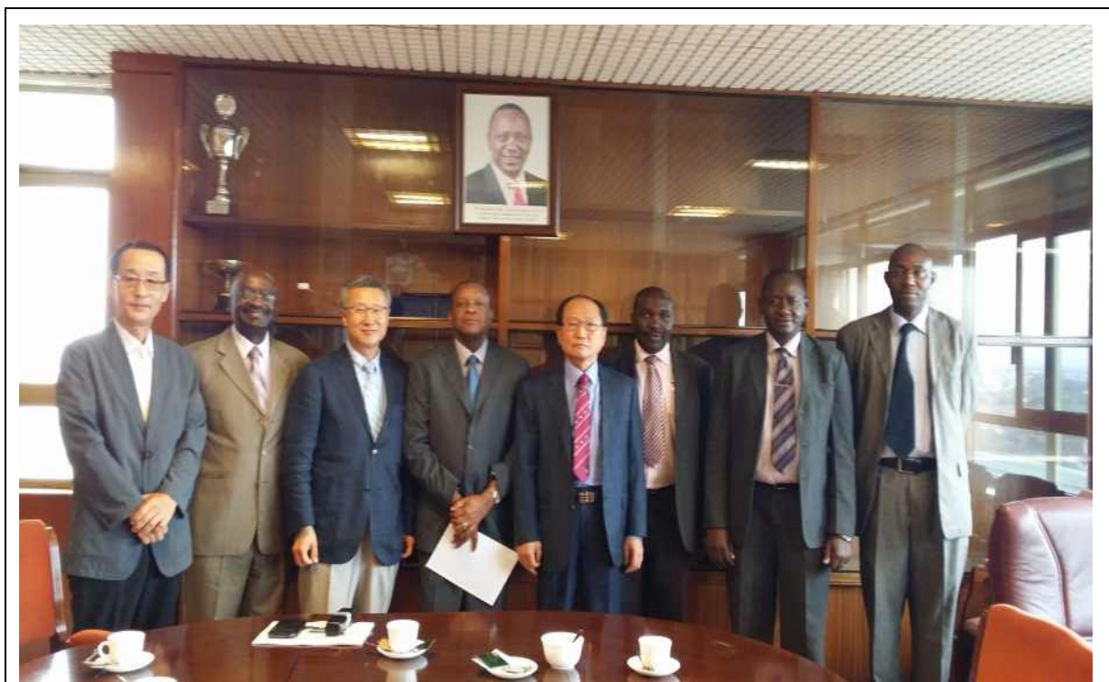
ITPO Korea's fact-finding mission to Africa: Meeting with the Ministry of Industrialization in Kenya

Moreover, ITPO Korea has been continuing to expand its relationship with Korean companies by exchanging information on developing countries, ideas on investment project development and financial news. ITPO Korea is also promoting the Korean private companies in potential markets if they have interests in entering into new markets in developing countries or if they developed new technologies which are assessed as necessary technologies for developing countries' industrialization in environmental-friendly way. The main purpose of overseas missions was to identify potential sectors for developing and measuring potentiality to develop cooperative investment projects in biogas power generation, environment and industrial cluster establishment between Korea and target countries.