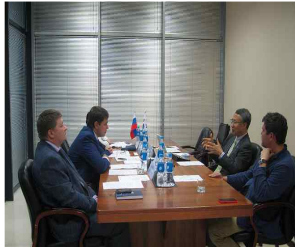
Meeting with the Government of Primorsky Province