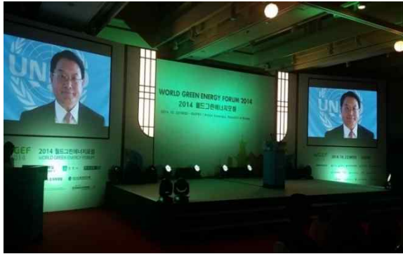
UNIDO Director-General for his congratulatory remark at the WGEF 2014