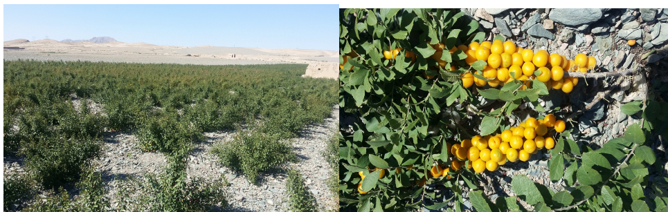
Photos taken in 2015 on Gai Fruit Plantation in Guansu Province at the semi desert.