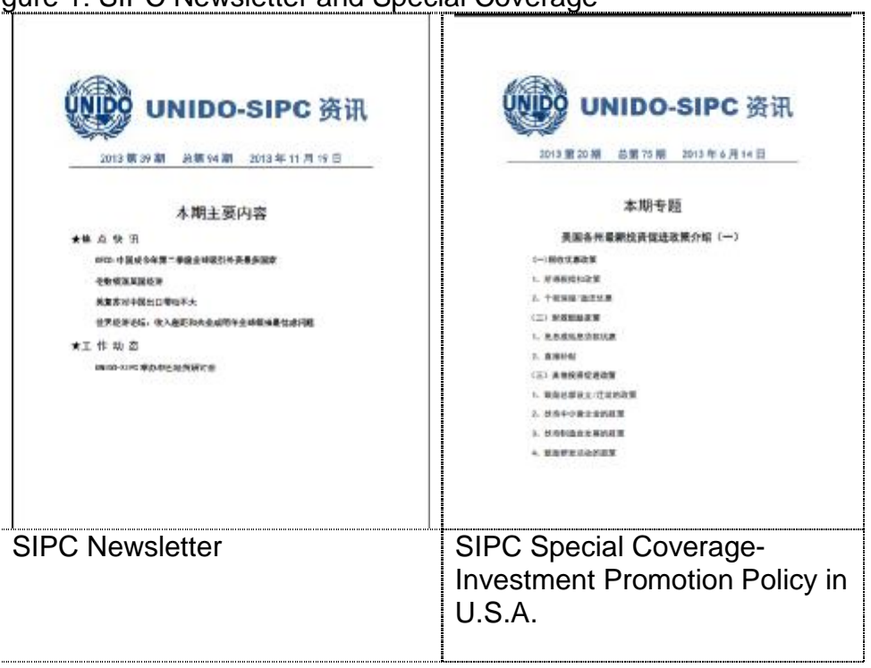
Figure 1: SIPC Newsletter and Special Coverage

11 overseas investment promotion seminars and workshops with 940 participants have been organized, co-organized or supported by SIPC in 2013, including the themes of country presentations, project demonstrations, professional service, cross-regional theme forums and UNIDO themed forum. Most of the country presentations or professional service workshops were co-organized with municipal government authorities, regional departments of InvestSH, Chamber of Commerce, foreign investment promotion agencies and commercial sections of Consulate Generals in Shanghai.