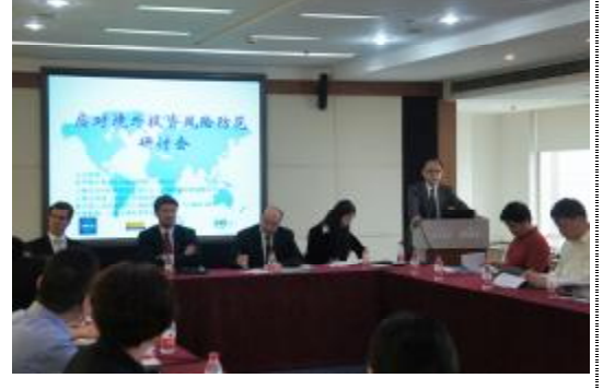
MIGA Risk Management Seminar for Chinese Outbound Investment