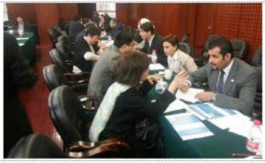
Bahrain-Chinese Entrepreneur Investment Forum B2B Meeting