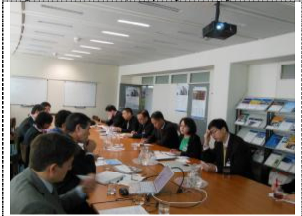
Shanghai Municipal Commission of Commerce Delegation in UNIDO

Figure 7: Accompanying Shanghai Municipal Commission Delegation to UNIDO