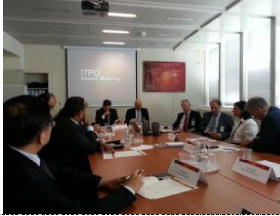
ITPO Heads' Meeting