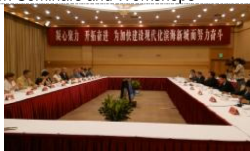
French Charente Yacht Association Delegation's Meeting with Fengxian District Government