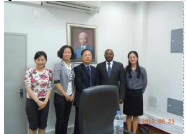
Meeting with Mozambique Investment Promotion Center in Maputo

Figure 5: Mission to South Africa, Mozambique and Botswana