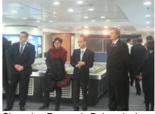
Slovenian Economic Delegation's visit to Shanghai

Figure 8: Meetings with Foreign Delegations