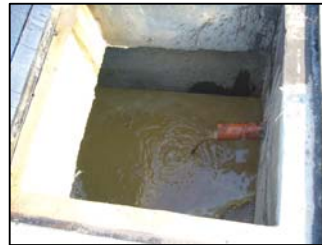
Waste Water Treatment