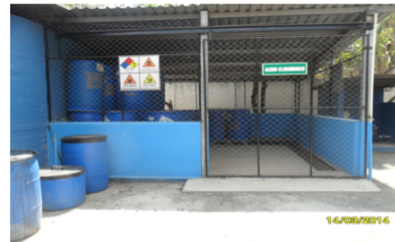
HCl new storage