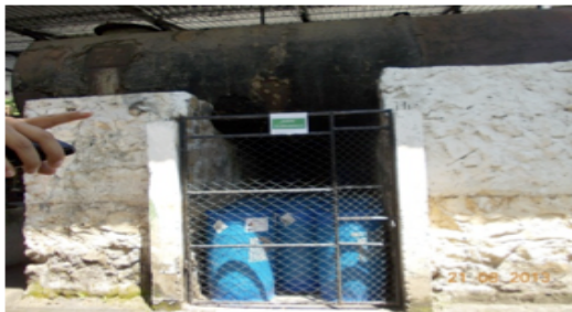
HCl old storage

In a simple glance is possible to see the improvements obtained in ASFALCA on chemical management with the implementation of a new acid storage. Also the management of chemical products has improved as seen in the photographs.