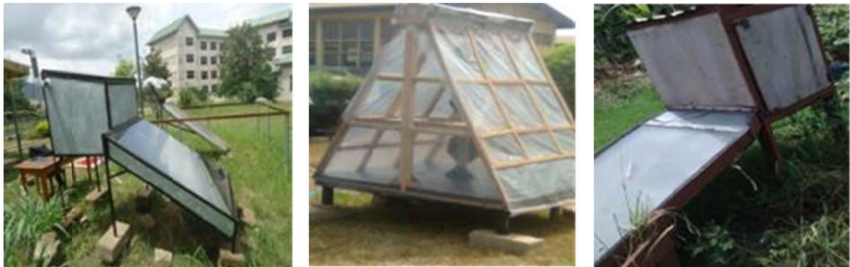
Figure 8: a) Mixed mode solar dryer at Koforidua Polytechnic, b) Direct solar dryer and c) indirect solar dryer

in Figure 8a, b and c. There are pilot hybrid solar drying systems in some research institutions.