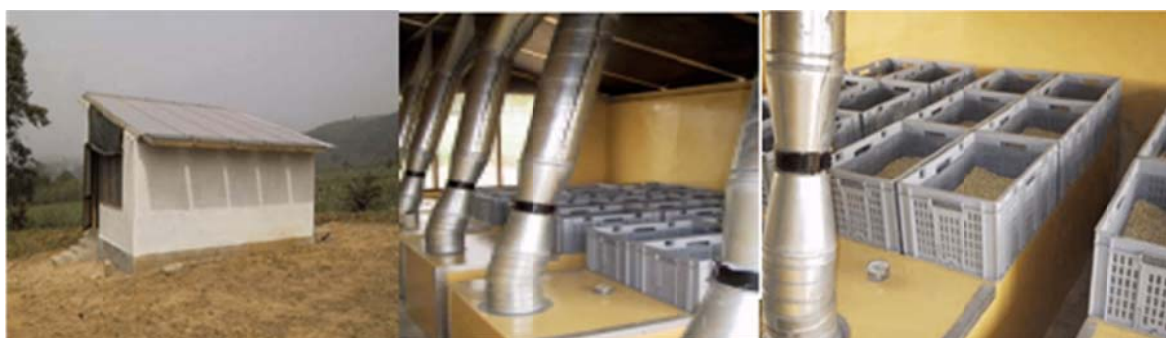
Figure 12: Test solar air collector dryer at Silwood farms-Pokoase

Figure 12 shows one of the large-scale solar dryers that were piloted at Silwood farms. This test solar air collector at Silwood farms is one of the many examples of pilot solar drying systems that have been carried out in the country. This system is located at Pokoase in the greater Accra region.