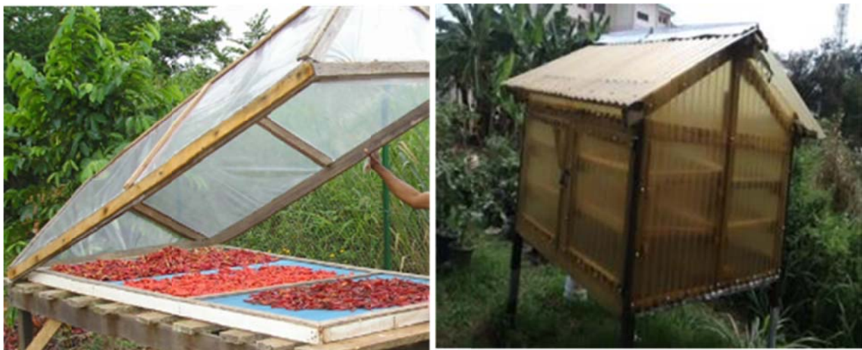
Figure 9: Different solar dryers for smallholder farmers

Individual farmers who can afford small dryers usually use it in their farms and Figure 9 shows the variations in these constructions. Generally most of these farmers use direct solar dryers in their farms.