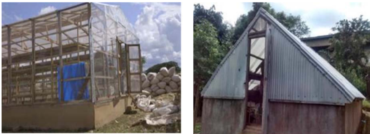
Figure 11: a) Tent type solar dryer at Sekyedumase and b) house solar dryer at Mampong

Figure 10 is a large-scale solar drying system installed for a group of farmers at Alavanyo in the Afram Plains district in the Eastern Region for the drying of maize. Figure 11 a is a large scale solar dryer at Nkoranza in the Brong Ahafo region for drying maize whilst Figure 11 b is also a large solar dryer at Mampong Akuapem in the Eastern Region for drying plant parts.