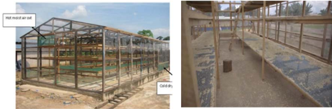
Figure 10: Large scale maize solar dryer by MoFA- inside and outside view

Figure 10 is a large-scale solar drying system installed for a group of farmers at Alavanyo in the Afram Plains district in the Eastern Region for the drying of maize. Figure 11 a is a large scale solar dryer at Nkoranza in the Brong Ahafo region for drying maize whilst Figure 11 b is also a large solar dryer at Mampong Akuapem in the Eastern Region for drying plant parts.