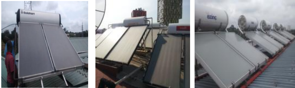
Figure 2: Pumped system with internal heat exchangers a) at Anita Hotel, Ashanti. b) at African Reagent Hotel, Accra. c) at Airport View Hotel.

which is used to increase the temperature of the hot water if the desired temperature is not attained using electricity from the national grid. Apart from the pumped systems with backups, there are other pumped systems in operation without backups such as those installed for domestic purposes.