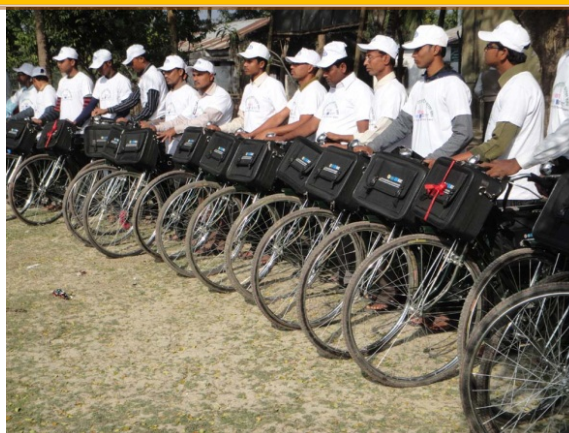
Field Assistant were provided the water quality Test kit and bicycle from BEST-BFQ, UNIDO