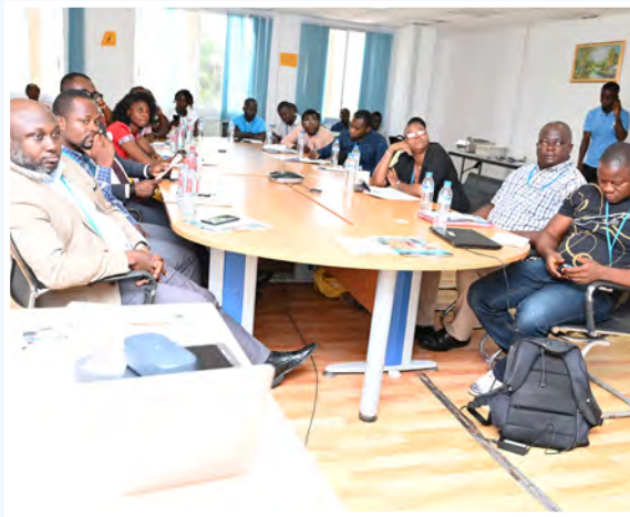
FIGURE 11: Industry stakeholders attend Access to Finance workshop in Monrovia