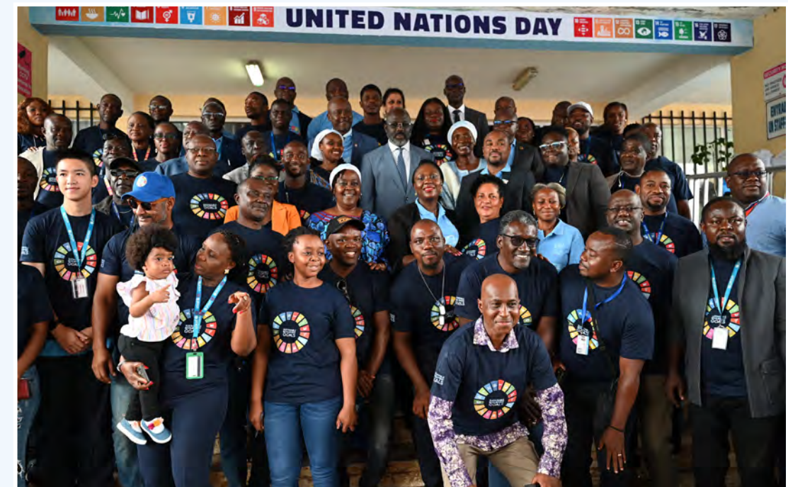
FIGURE 13: UN Family at the United Nations Day