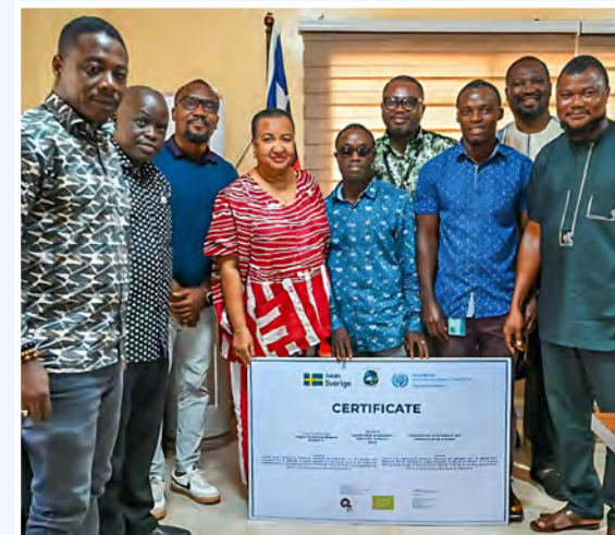
FIGURE 4: Left: GROW-2 team celebrates local cooperative's organic cocoa certification with former Minister of Agriculture, Ms. Jeanine Cooper. Right: Internal inspector reviews organic certification checklist with farmer as external evaluator observes