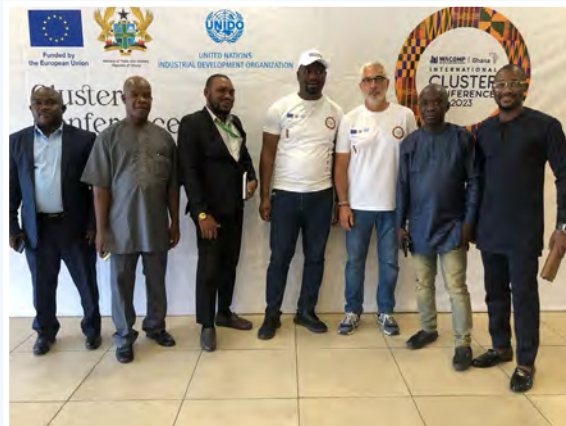
FIGURE 8: Liberia's Delegation at the International Cluster Conference in Ghana