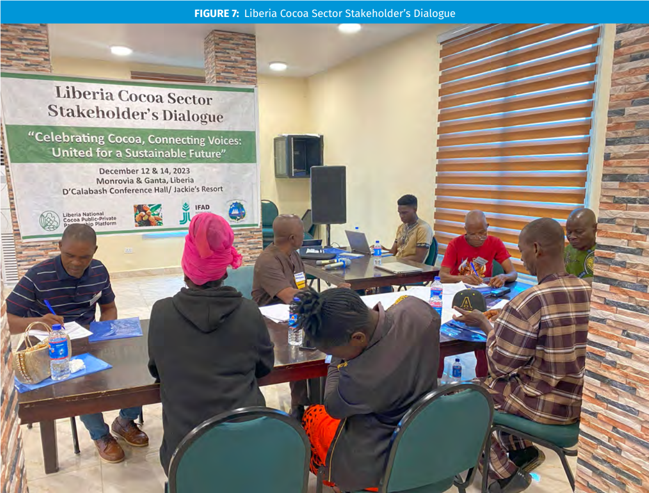
FIGURE 7: Liberia Cocoa Sector Stakeholder's Dialogue

The International Fund for Agricultural Development (IFAD), Sustainable Trade Initiative (IDH) and UNIDO are actively working to enhance the agricultural sector's readiness for the European Union Deforestation Regulation (EUDR). Through a series of strategic initiatives, the GROW-2 project has been instrumental in laying the groundwork for Liberia's agricultural sector to meet the requirements of the EUDR.