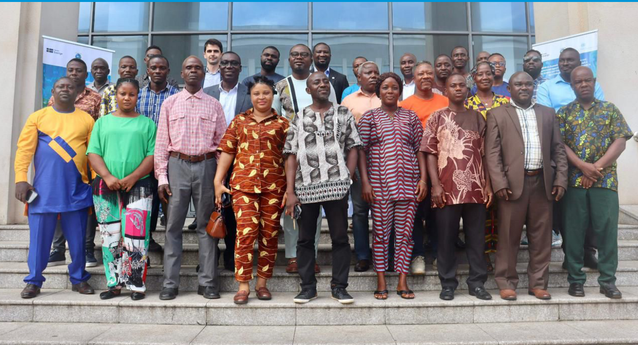
FIGURE 6: Family photo of EUDR workshop participants

In August 2023, GROW-2 facilitated a constructive engagement between the Liberia Agriculture Commodities Regulatory Authorities (LACRA) and the Cooperative Development Authority (CDA) with the Ghana Cocoa Board (Cocobod). The purpose was to delve into discussions concerning the EU Regulation on Deforestation, which is effective from 31 December 2024 and could impact Liberia's cocoa exports to the EU.