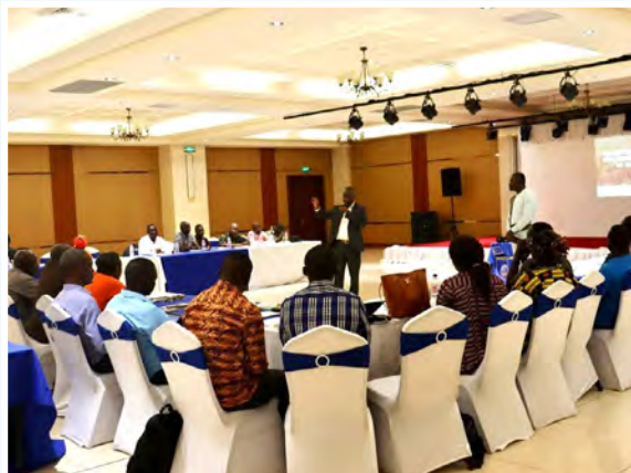
FIGURE 5: Industry stakeholders attend EUDR workshop in Monrovia