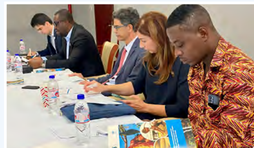
FIGURE 3: PSC members during the meeting

As discussion unfolded, PSC members highlighted the accessibility of roads for cassava and vegetable farmers in rural Montserrado, suggesting the project focus on these areas for maximum impact. UNIDO affirmed plans to assess opportunities in Montserrado and Margibi counties, proposing tailored recommendations for horticultural interventions to be presented at the next steering committee. The meeting also delved into communication strategies, highlighting the importance of newsletters, brochures, and an active social media presence for project visibility.